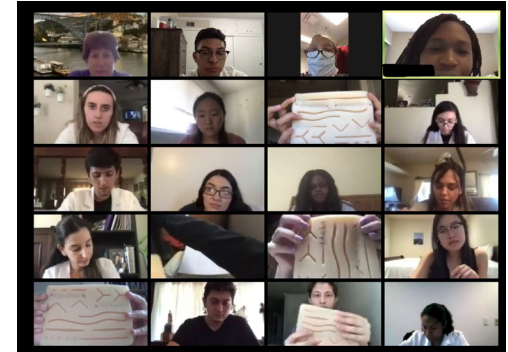
WesternU SHPEP, Medical Track (2020)