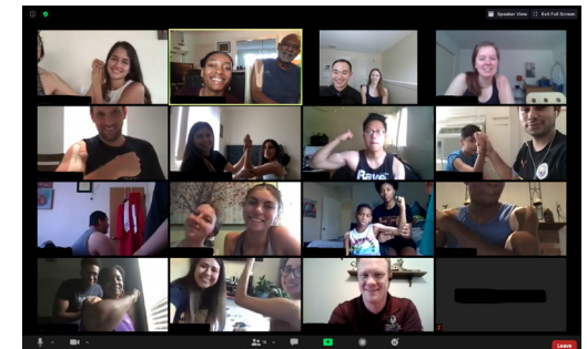
WesternU SHPEP, Optometry Track (2020)