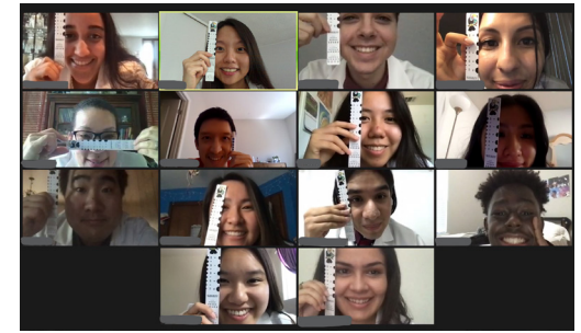
WesternU SHPEP, Optometry Track (2020)

Note: Curriculum schedule is subject to changes.