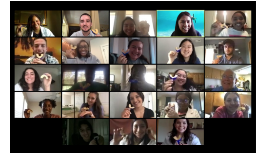
WesternU SHPEP, Dental Track (2020)